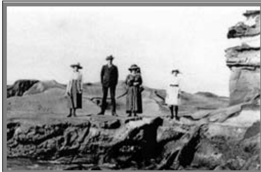
Terrigal – 1919

Wamberal Beach and lake north of Terrigal provided tourists, seeking quietly beautiful surroundings with all they could desire. It covered about 100 acres. Fine coastal views were seen from the surrounding hills, amongst which were picturesque orchards and vegetable gardens.