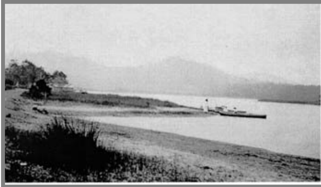
Wamberal – 1919

Wamberal Beach and lake north of Terrigal provided tourists, seeking quietly beautiful surroundings with all they could desire. It covered about 100 acres. Fine coastal views were seen from the surrounding hills, amongst which were picturesque orchards and vegetable gardens.